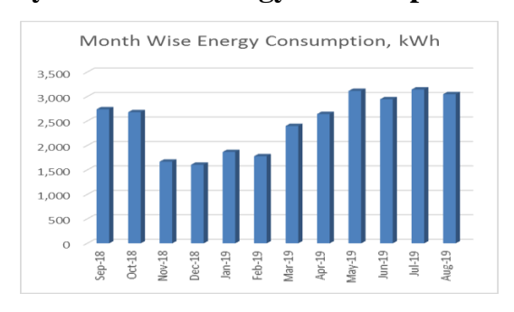
Figure 2.1: Monthly Electrical Energy Consumption