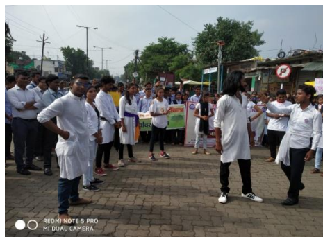
Volunteers Presenting a street play