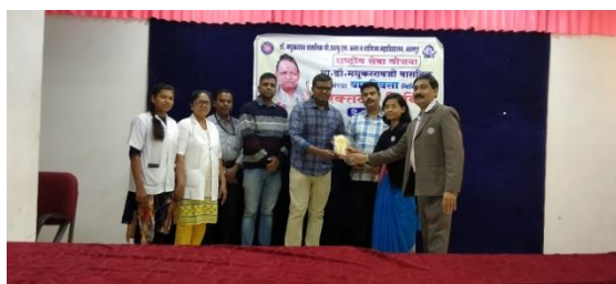
The team of doctors from Indira Gandhi Medical Hospital giving the memento and certificate to the NSS Coordinator