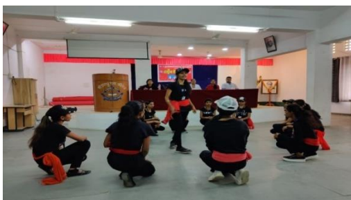
The students of this Nursing school presented a skit on Woman Empowerment