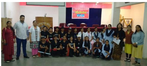
The students of this Nursing school, teachers and doctors