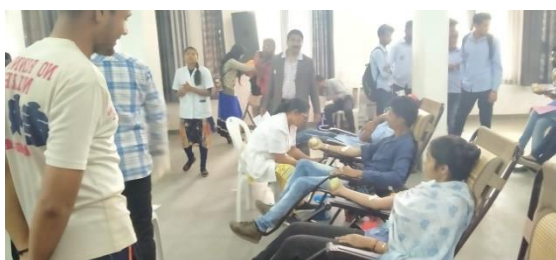
Students donating blood