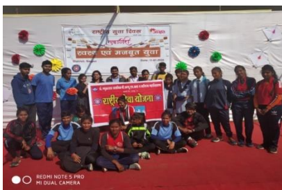
NSS volunteers present at the programme organized on the occasion of Yuva day at university ground.

The NSS volunteers actively participated in the Yuva Day an event organized by NSS Unit of RTM Nagpur University to observe Birth Anniversary of Swami Vivekanand on January 11, 2020 at 8 AM at University Groundy. various Physical activities and sports were arranged for the students.