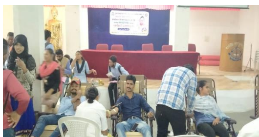
Students donating blood