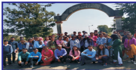
Study Tour at Wadagaon Dam