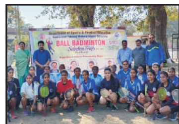
Students in Ball Badminton Selection Trial Session of the University