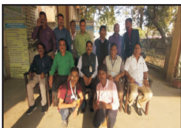
Principal and other teachers with Sports Winner