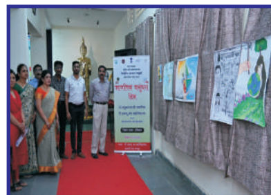
World Earth Day Celebration Poster making competition