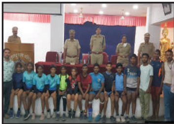
Guidance Session for Students by Police Department