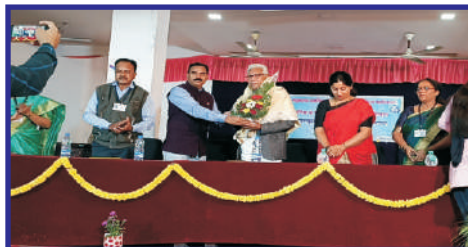
Felicitation of Guest in Annual Cultural and Sports Festival of Jr. College.