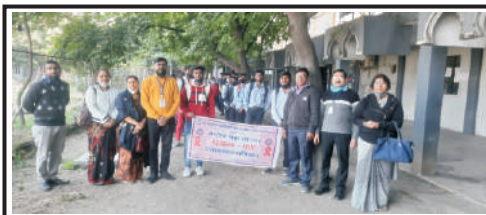
AIDS Awareness Rally