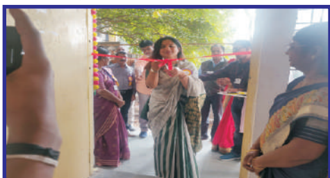
Annual Cultural and Sports Festival Jr. College