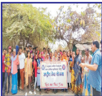
Environment Day Rally Organized by NSS Volunteers