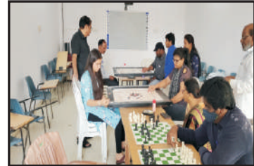
Chase Practice at Sports Academy