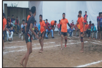
Inter Collegiate Kabaddi Men