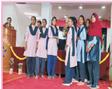
Annual Sports Event Felicitation of Team

The college staff and Management organizes a Big Farewell Programme for the teachers and non - teaching Staff on their day of retirement and such employees are felicitated by the Management and Principal of the college for their committed lifelong academic and administrative services rendered to the institution and the whole staff bids farewell to them with heavy hearts.