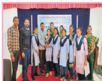
Prize Distribution to winning team in Jr. College Annual Sports Festival