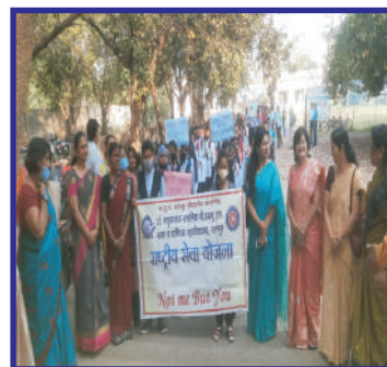
Women's Day Environment and Female Feticide Awareness Rally