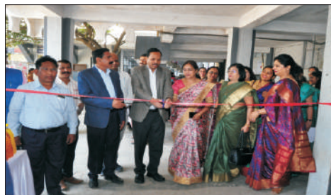
Inauguration of Women's Entrepreneur's Meet 2023