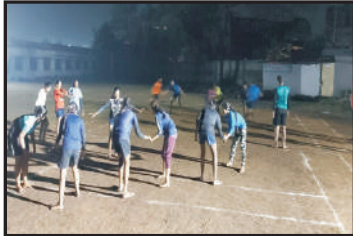
Inter Collegiate Kabaddi Women