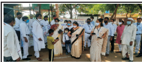
Mask Distribution at Kavtha