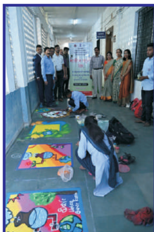
World Earth Day Celebration Rangoli contest