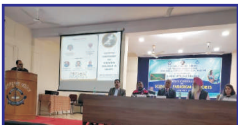
One Day National Conference in Sports