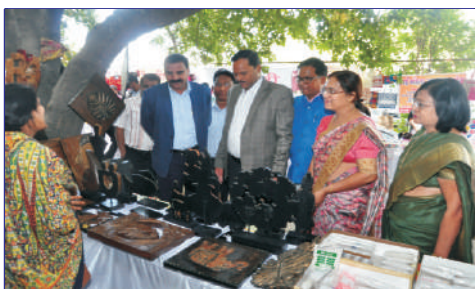
Visit to Stall by the Guest in Women's Entrepreneur's Meet 2023