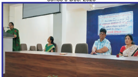
Marathi Bhasha Gaurav Divas