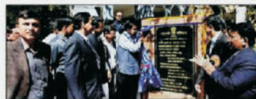
■ Releasing Of Corner Stone Of Preamble Of The Constitution