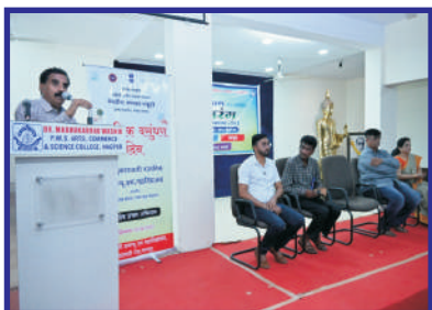
World Earth Day Celebration in association with Central Bureau of information Dept. Govt. of India

The college has active EVS Cell and it takes care to nurture the environmental awareness among the students. The study tours are regularly organized by the EVS Cell to make them aware about environmental issues, drain of natural resources, water pollution, air pollution, soil erosion and so on. The cell organizes various activities to mark World Environment Day as Jagtik Wasundhra Din in every academic year.