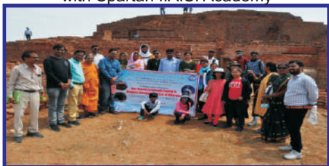
Study Tour during certificate course on Buddhist Heritage Tourism of Vidarbha