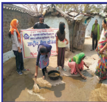
Cleanliness Assistance by student of Environment Science and NSS to Villagers