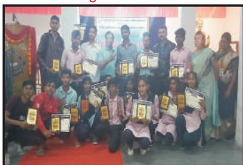
Students Felicitation in Annual Sports Festival Jr. College