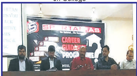
Career Guidance One Day Workshop with Spartan I.A.S. Academy