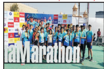
Student Participation in Lokmat Marathon