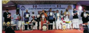
■ Release of Golden jubilee souvenir