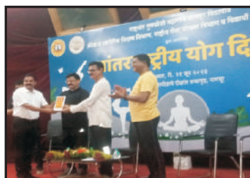
First Runner-up Award to the college in Inter collegiate Yoga Day-SuryaNamskar Contest