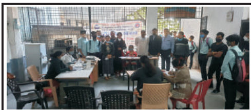
Free Health Checkup Camp

The college has National Service Scheme Unit since 1984 and it is one of the most vibrant departments of the institution. It has left memorable influence with its integrity and sincerity towards the active participation in all national level, university level, state level and inter collegiate level activities and annual special camps. In every academic session the unit documents its outstanding performance and active participation in all types of social, cultural, academic, environmental and philanthropic ventures conducted by different institutions. NSS adopts any village in rural area for three years to organize annual special camp and conduct various academic, social, cultural and environmental activities as per the need of the villagers. NSS volunteers have done outstanding contribution in Covid-19 awareness, vaccination drives, food distribution to the needy. In this way, during pandemic hit NSS unit of the college has rendered very devoted and dedicated services to the society.