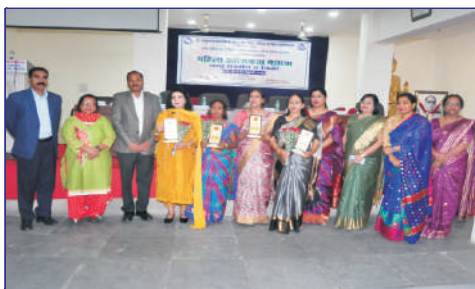
Dynamic & Successful Women Entrepreneurs Felicitation

The Women's Development Cell also actively works to boost up women entrepreneurship and self employment. Every year saving Group Expo and Sell activity is conducted to gear up the rural employment and strengthen the economic conditions of rural women folk.