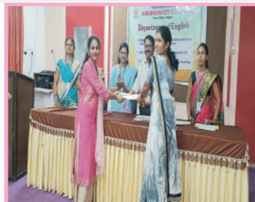
First Prize to the college in Inter Collegiate Quiz Competition on Literature for Post Graduate Students in English Org. by SBCT College Nagpur