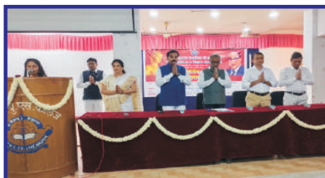
Dr. Babasaheb Ambedkar memorial lecture series 6 Dec. 2023