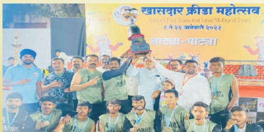
2nd Prize Winner Team of the College in Aatya-Patya Competition in Khasdar Krida Mahotsav 2023