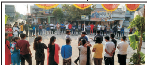
Annual Special Camp