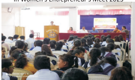
Discrimination of Labour & Gender Issues Symposium