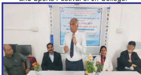
Seven Days Workshop on NET-SET-PET Preparation