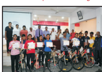
1st three winners from Boys & Girls in Inter Collegiate Cycle Race. organized on 2 oct. 2023