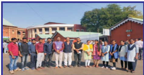
Visit to Winter Session Vidhan Bhavan