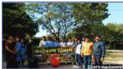
Energy Conservation Awareness

The college has active EVS Cell and it takes care to nurture the environmental awareness among the students. The study tours are regularly organized by the EVS Cell to make them aware about environmental issues, drain of natural resources, water pollution, air pollution, soil erosion and so on. The cell organizes various activities to mark World Environment Day as Jagtik Wasundhara Din in every academic year.