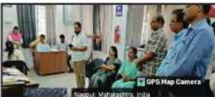
Chala Mahatma Phule, Dr. Ambedkar and Bhartiya Sanvidhan Wachu ya! headed by Hon. Dr.Nitin Raut.