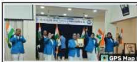
Bhartiya Sanvidhan Campaign