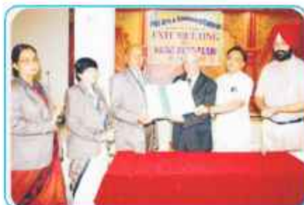
Second Cycle in September 2011 (B Grade)