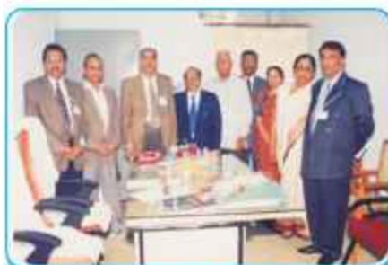
First Cycle in December 2003 (B++Grade)