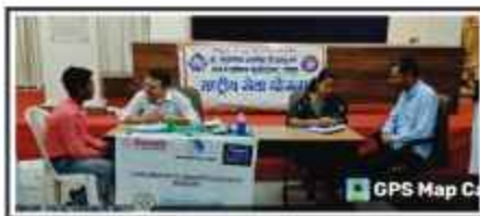
Free Health Checkup Camp

The college has National Service Scheme Unit since 1984 and it is one of the most vibrant departments of the institution. It has left memorable influence with its integrity and sincerity towards the active participation in all national level, university level, state level and inter collegiate level activities and annual special camps. In every academic session the unit documents its outstanding performance and active participation in all types of social, cultural, academic, environmental and philanthropic ventures conducted by different institutions. NSS adopts any village in rural area for three years to organize annual special camp and conduct various academic, social, cultural and environmental activities as per the need of the villagers. NSS volunteers have done outstanding contribution in Covid-19 awareness, vaccination drives, food distribution to the needy. In this way, during pandemic hit NSS unit of the college has rendered very devoted and dedicated services to the society.