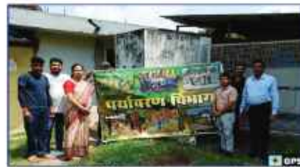
Plastic free campus campaign