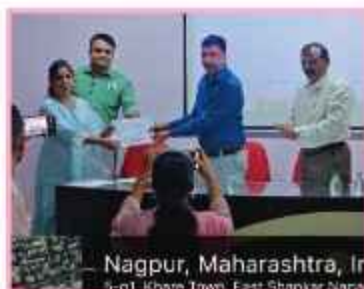
Inter Collegiate Essay Competition First Winner

The college staff and Management organizes a Big Farewell Programme for the teachers and non - teaching Staff on their day of retirement and such employees are felicitated by the Management and Principal of the college for their committed lifelong academic and administrative services rendered to the institution and the whole staff bids farewell to them with heavy hearts.