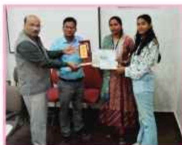
Inter Collegiate Debate Competition Second Winner