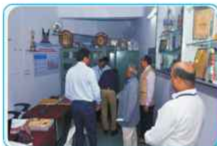
Third Cycle in October 2017 (B+Grade)