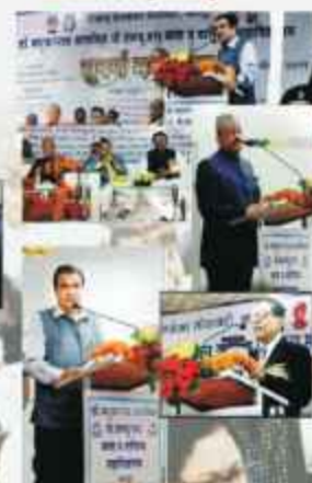
■ Greetings to institution and address to the gathering