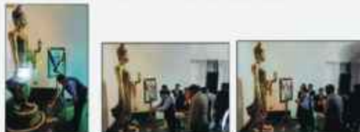
■ Salutation to Lord Budha & Dr. Babasaheb Ambedkar