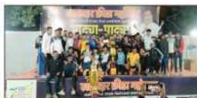
Khasdar Krida Mohotsav Atyapatya Tournament Mens and Women both teams Secured Second Place in both section on dated 19-20 January 2025.