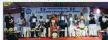
■ Release of Golden jubilee souvenir