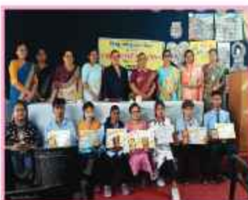
Inter Collegiate Elocution Competition Winners