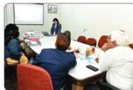
Fourth Cycle in April 2024 (B Grade)