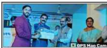
Voters Awareness Campaign