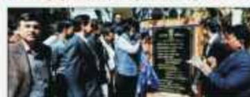
■ Releasing Of Corner Stone Of Preamble Of The Constitution