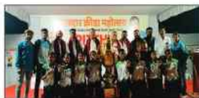
Khasdar Krida Mohotsav Pittu Tournament Women Secured Second Place on dated 27 January 2025