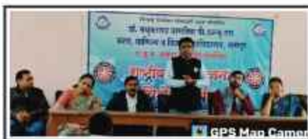
Annual Special Camp