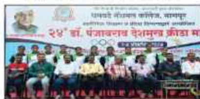
24th Panjabrao Deshmukh Krida Mohotsav Kabaddi Tournament Women Team Secured Third Place and Cash Prize 1st to 4th October 2024